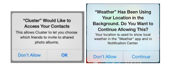
Figure 3: iOS's just-in-time notice with purpose explanation (left) and periodic reminder (right).

odic reminders for apps that have permission to access the user's location in the background, see Figure 3. Both iOS and Android also use a persistent location icon in the toolbar indicating that location information is being accessed.