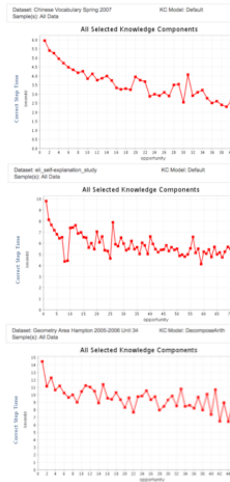
Figure 2. Examples of different kinds of Knowledge Components and associated learning curves from student performance in units from three different courses, Chinese, English as Second Language, and High School Geometry. The curves on the right show the change in the average time for a correct application of a knowledge component (the y-axis) after successive opportunities to learn it (the x-axis). Data points are averaged over all students and knowledge components.