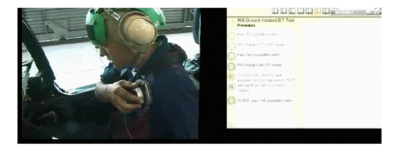
Figure 4: Participant turning dial to navigate through INS Bit Test Task in F/A-18 cockpit (what he sees is Interface B on the right side of this figure).

Figure 4 illustrates the view each participant began with for the INS Bit Test task while using Interface B. As the participant turned the dial, different steps in the procedure would be highlighted. Navigational problems often were associated with the I/O device For example, an expert maintainer experienced confusion when he turned the dial too quickly "Think I went too fast for the dial. I'm going through a bunch of steps trying to catch up. I think I went too far. All right. I've got it now. Next page..." (P001) Other problems arose from maintainers being unsure about how to go backwards and forwards. To get a clearer sense of the navigational experience of participants using Interface A, please use the accompanying CD and see ONR_7_UseofLink_WUI.mov. In this instance, the participant cannot determine how to get to the term "here" to accomplish a link and asks the experimenter for advice about where to click.