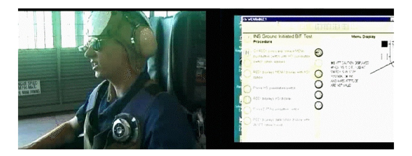
Figure 6 : Participant viewing magnified figure using Interface B.

Using Interface B, the participant initially could not see lettering on the IETM illustration. He magnified it to read the accompanying text better and scrolled around to be sure he could see the entire illustration. This enabled him to have confidence that he knew everything he needed to proceed with the task.