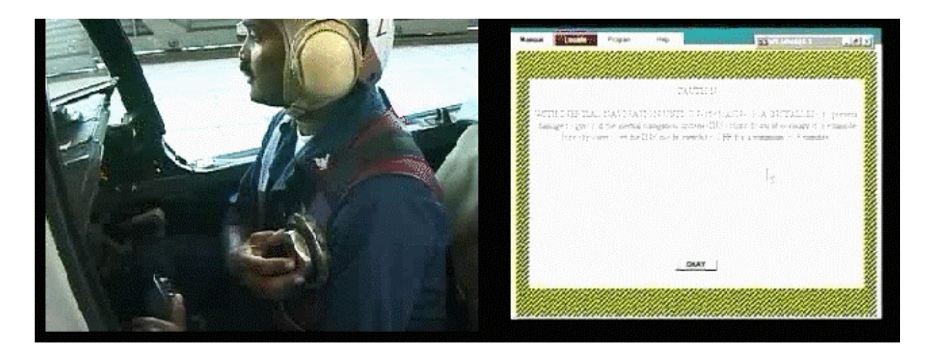
Figure 7: Participant using Interface A to view a caution in the INS Bit Test task