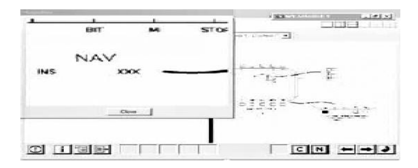
Figure 5: Participant viewing magnified illustration using Interface A.

Magnification was used with each of the interfaces and the users' views of magnified IETMs are shown next in Figures 5 and 6. In general participants did not have difficulty using the magnification features. As noted later in this report, the participants each expressed a desire to have such magnification capabilities in IETMs.