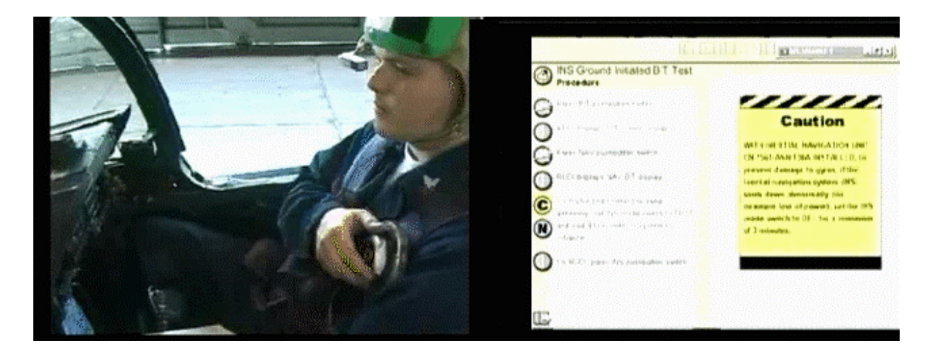
Figure 8: Participant using Interface B to view a caution in the INS Bit Test task

Table 2 shows that participants 004 and 006 had totally different experiences with Interface A and B (no problems with one and many problems with the other). All other participants had a slight difference in performance. However, comparing performance between Interface A and B, there is no significant difference in the total number of problems other participants experienced. There did appear to be more problems with navigation backward and forward with Interface B. Participants' performance was consistent with their interface preferences that they expressed. These preferences are reported in the next section and discussed later in this report.