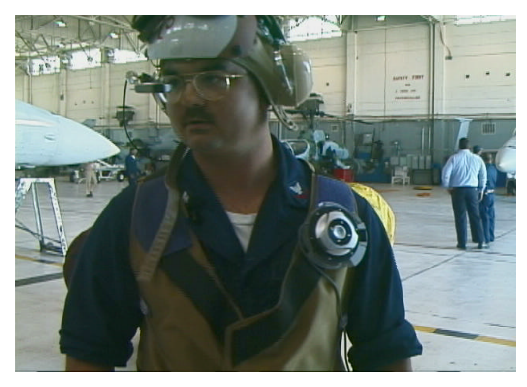
Figure 1: Maintainer wearing vest containing IBM wearable computer with dial for I/O and head-worn display on cranial cap in front of right eye